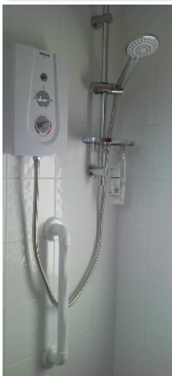
Thermostatical Controlled Safety Electric Shower