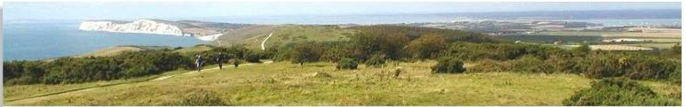
View from downs above Brighstone easy walking distance from holiday cottage

Wighthols Isle of Wight Self Catering Accommodation 2003 - UK