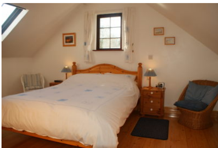
King Size bed